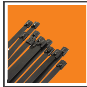
Type: Roller Ball Coated Width: 4.6 mm and 7.9 mm Material: SS 304 & SS 316