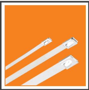
Type: Roller Ball Un-coated Width: 4.6 mm and 7.9 mm Material: SS 304 & SS 316